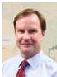
Bill Schuette ★