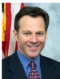
Eric Schneiderman ★